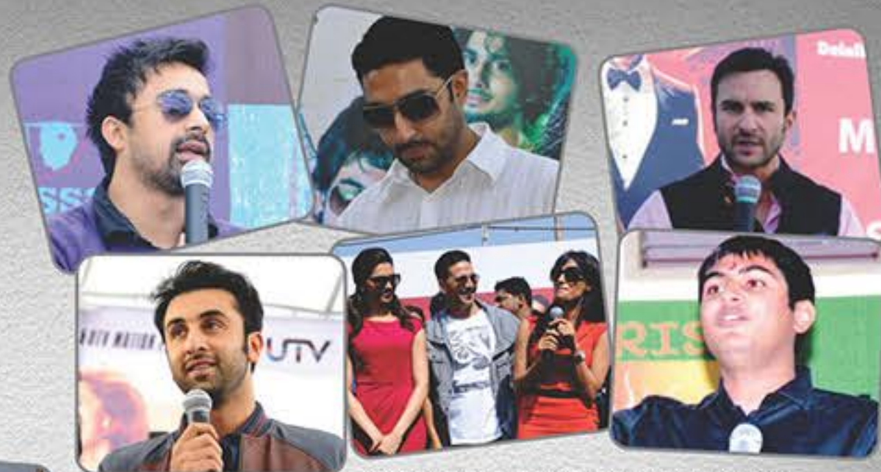
CELEBRITIES @ RENAISSANCE