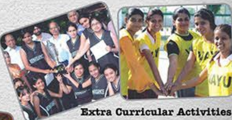
Extra Curricular Activities